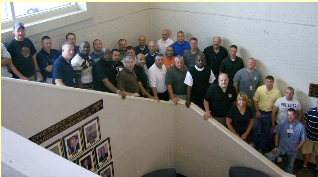
2011 SRO Basic Training graduates from OPOTA London